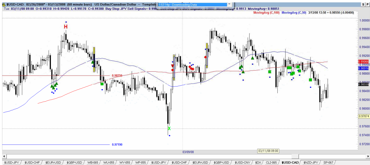
Example C: USD/CAD Hourly Price Chart, courtesy of Genesis Financial Technologies

The market is trading sideways with enough distance to fool the computer into thinking it is developing a trend. Notice how the red and green arrows suggest getting in to the market just at the time the market would reverse.